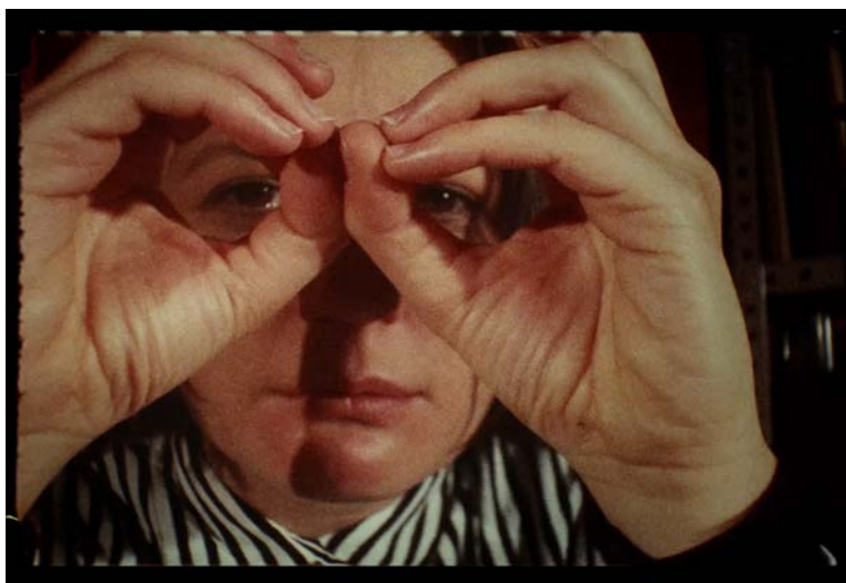
Artur Żmijewski, Compassion , 2022, film still, courtesy of the artist, Foksal Gallery Foundation, Warsaw and Galerie Peter Kilchmann, Zurich.