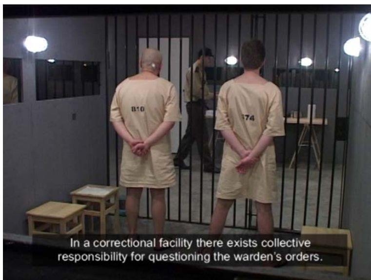
Artur Żmijewski, Repetition , 2005, film still, courtesy of the artist, Foksal Gallery Foundation, Warsaw and Galerie Peter Kilchmann, Zurich.